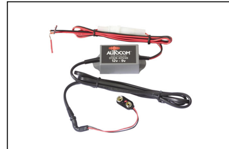
Part 151. (PSU-9) 12 volt to 9 volt bike power lead for Easi-7-Advance