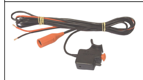
Part 156. (R5-12) Bike power loom (Part B of a two part power lead) for a remote mounted Pro-7-Sport (shown plugged into part 155)